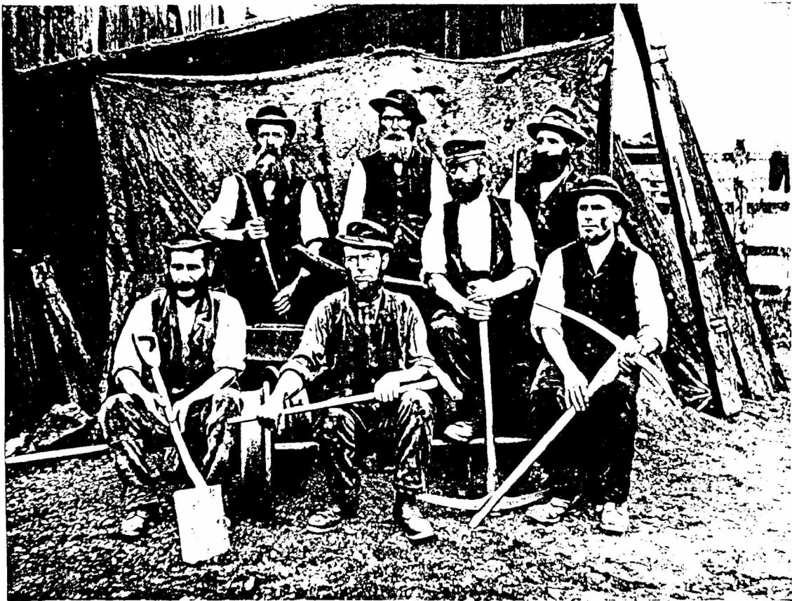
— A Gang of Platelayers. —